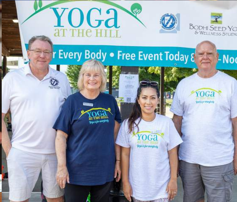
YOGA at THE HILL