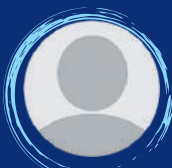
VACANT Communications Coordinator