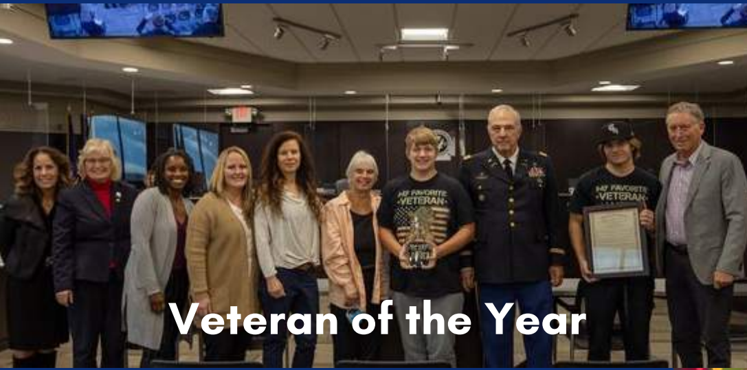
Veteran of the Year