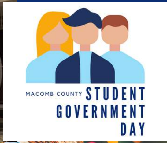
MACOMB COUNTY STUDENT GOVERNMENT DAY