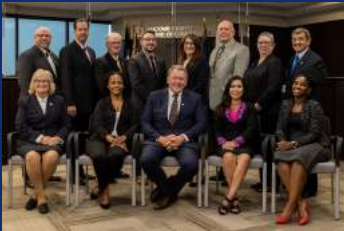
Board of Commissioners