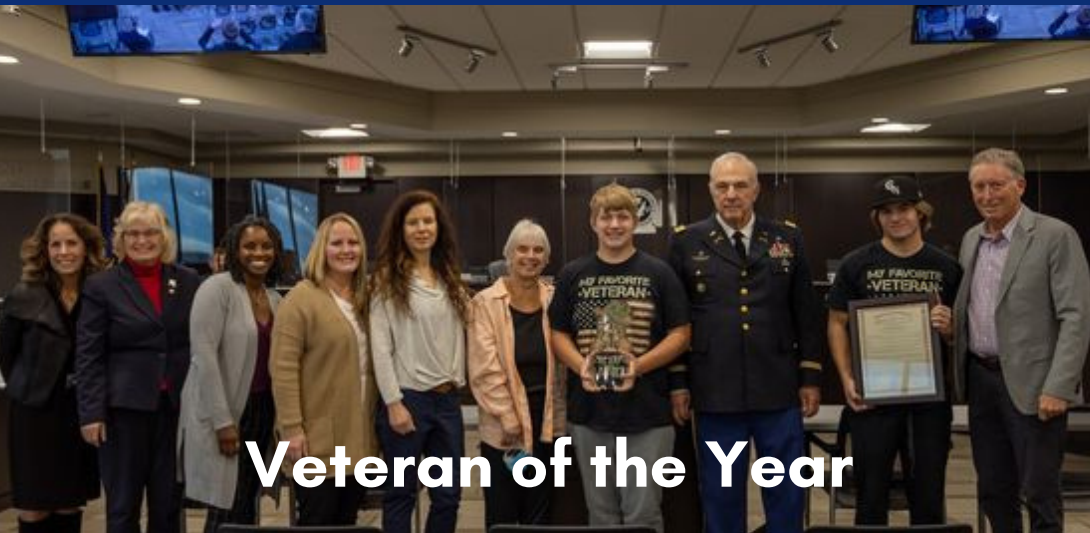
Veteran of the Year