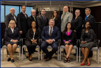
Board of Commissioners