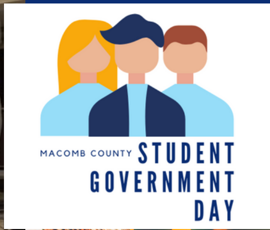
MACOMB COUNTY STUDENT GOVERNMENT DAY