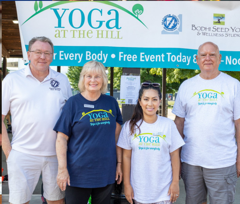
YOGA at THE HILL