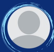
VACANT Communications Coordinator