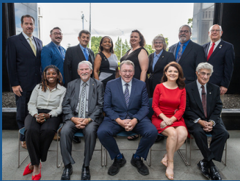
Board of Commissioners