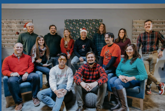
HUNCH FREE Digital Marketing Firm