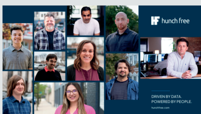
HUNCH FREE Digital Marketing Firm