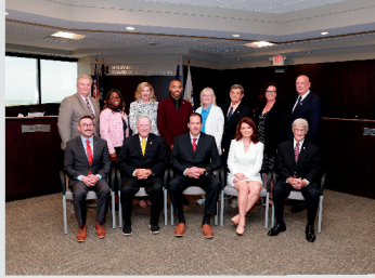
Board of Commissioners